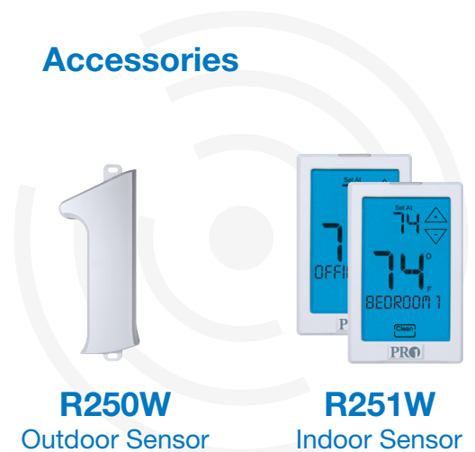
R250W Outdoor Sensor