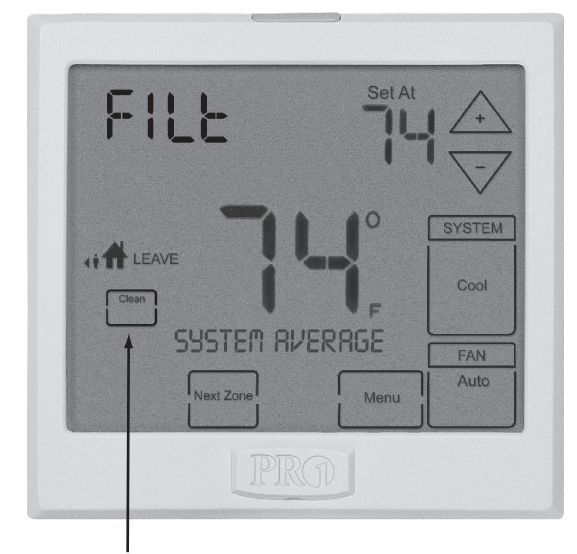
Hold down CLEAN for 3 seconds, to reset filter reminder.

Resetting the filter change reminder: When FILT reminder is displayed, you should change your air filter and reset the reminder by pressing the CLEAN key for 3 seconds. FILT will leave the display when reset.